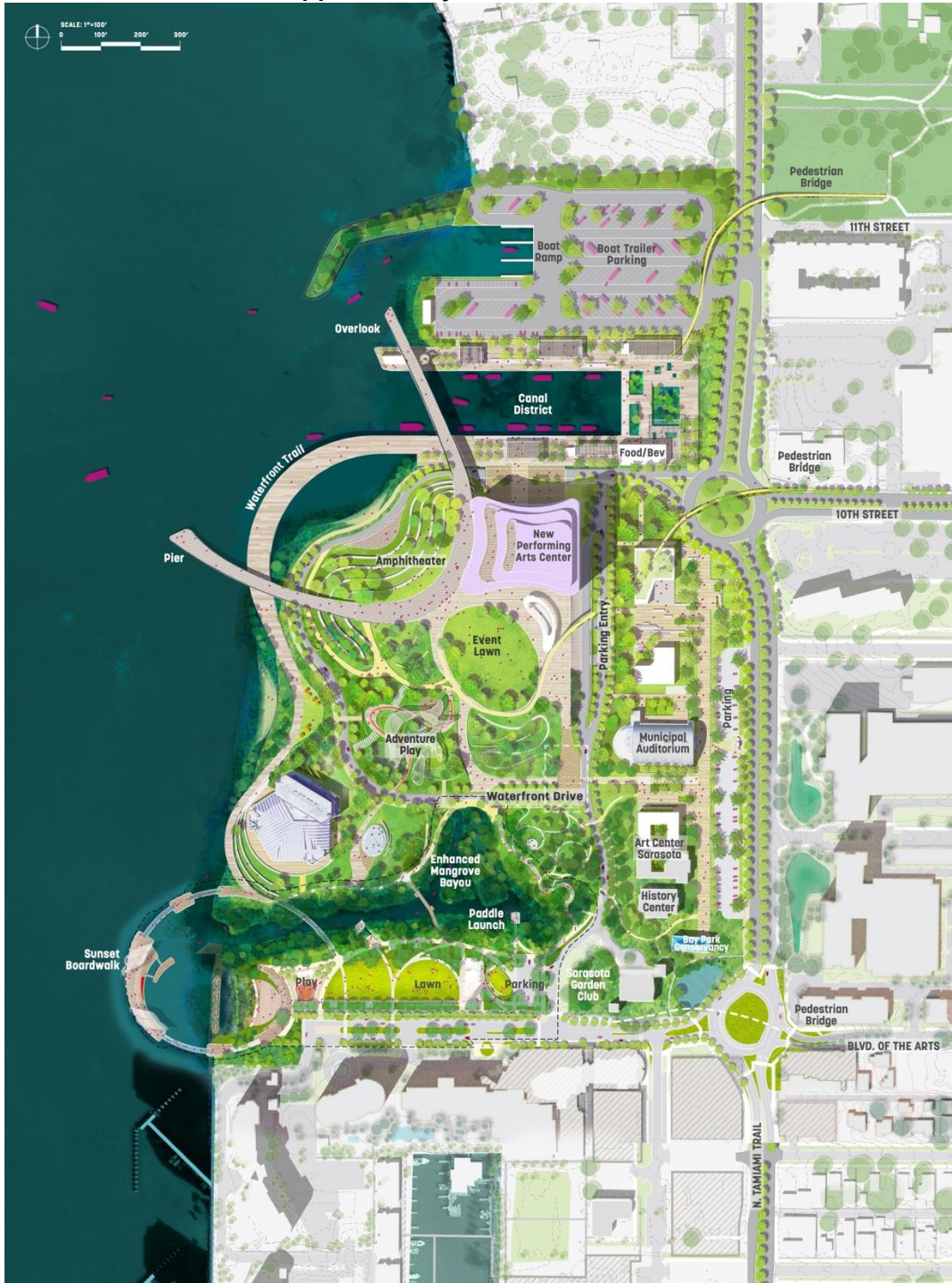
EXHIBIT B Approved Bay Park Master Plan